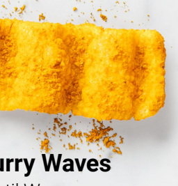
+ Kerala Curry Spice Mix